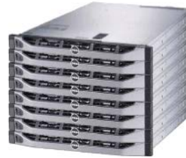
Dell PowerEdge R320 Dell PowerEdge 720xd